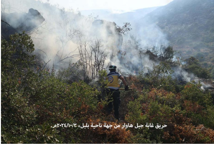
حريق غابة جبل هاوار من جهة ناحية بلبل، ٢٠٢٤/١٠/٣م