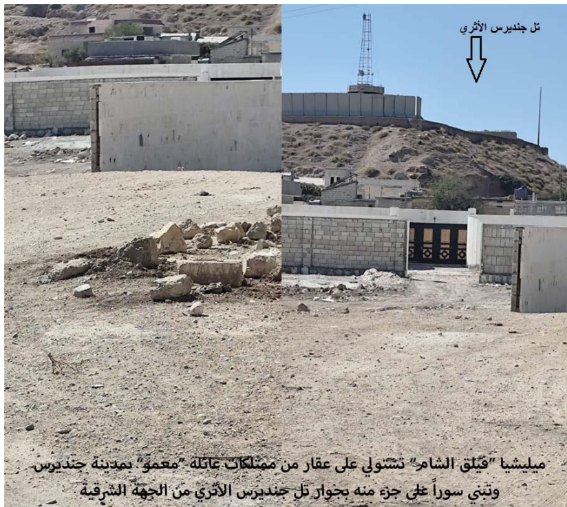
ميليشيا "فيلق الشام" تستولي على عقار من ممتلكات عائلة "معمو" بمدينة جنديرس وتبني سوراً على جزء منه بجوار تل جنديرس الأثري من الجهة الشرقية

In our report No. (286) dated May 4, 2024, we detailed how the "Sham Legion," an Ikhwani militia, and its leaders seized properties belonging to the "Mamo" family south of Jenderes. Despite all attempts by the family members to reclaim their property through Turkish occupation courts and intermediaries, they were unsuccessful. The leaders of the Legion have even expanded their projects, constructing a wall around approximately /3/ dunams of land directly east of the Jenderes archaeological hill. A local source suggests that the purpose of this is to conduct excavations to unearth and steal buried artifacts and treasures.