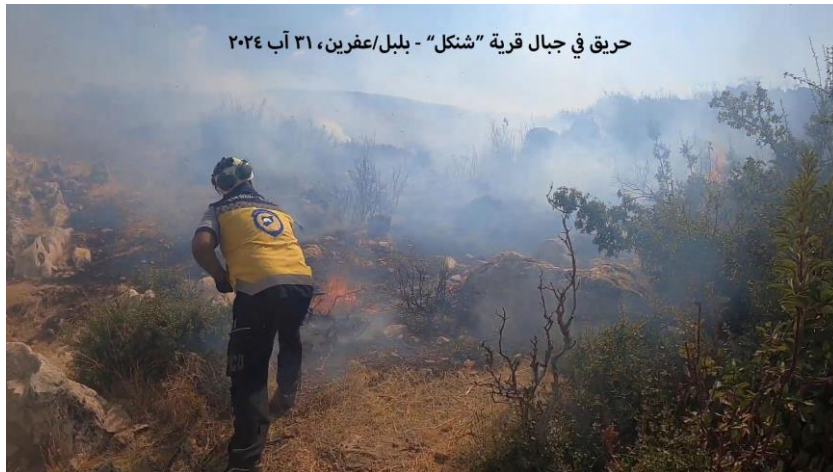
حريق في جبال قرية "شنگل" - بلبل/عفرين، ٣١ آب ٢٠٢٤

• According to a local source, fires were set to "Shingeileh" village's – Bulbul mountains, during August 31, 2024, until September 3 rd , 2024. The fires consumed large areas of the natural forests and some of the bearing trees fields. The "Syrian Civil Defense" confirmed that its teams contributed in extinguishing the fire, and on Friday, September 13, 2024, it was set again.