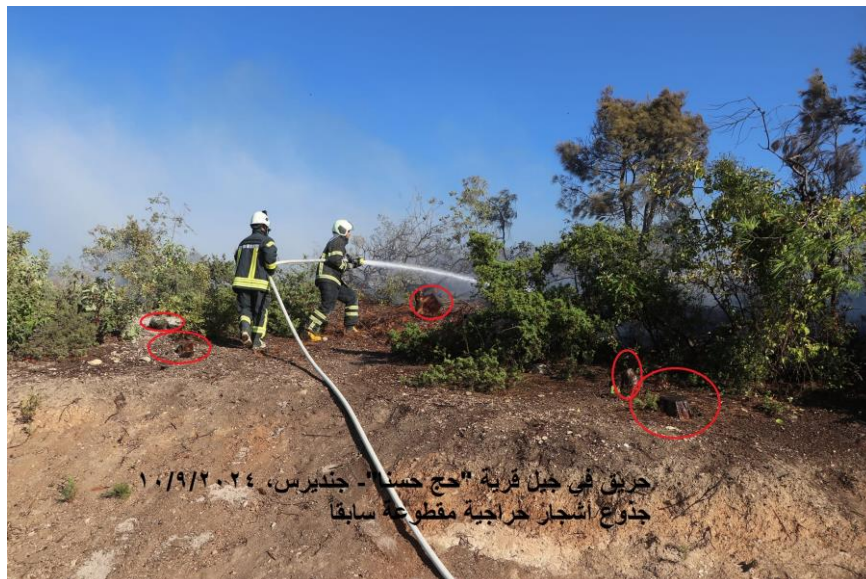
حريق في جبل قرية "حج حسنا" - جنديرس، ١٠/٩/٢٠٢٤ جذوع اشجار خراجية مقطوعة سابقاً

• According to a local source, fires were set on September 10, 2024, in the forests near "Haj Hasna" village (Jenderes district), burning vast areas, while the "Syrian Civil Defense" asserted that its teams had narrowly extinguished the fires, and through the published photos trunks and remains of previously chopped trees are noticeable. And on September 11, 2024, the fires came back burning five donums according to the Civil Defense and on Friday, September 13, 2024, they were set again.