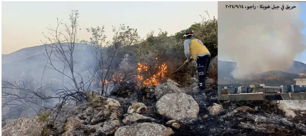
حريق في جبل هوبكا - راجو، ٢٠٢٤/٩/١٤

• The "Syrian Civil Defense" reported that its teams quelled a fire in a natural forest in "Hobako" village – Raju, and today the fires were set yet again.