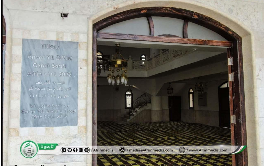
المسجد الشريف/انور يلدرم من النمط العثماني، تم بناؤه من قبل هيئة الاغاثة الإنسانية IHH التركية، على عقار "كراج جنديرس" السابق، وسط مدينة عفرين، افتتح صيف عام 2023م